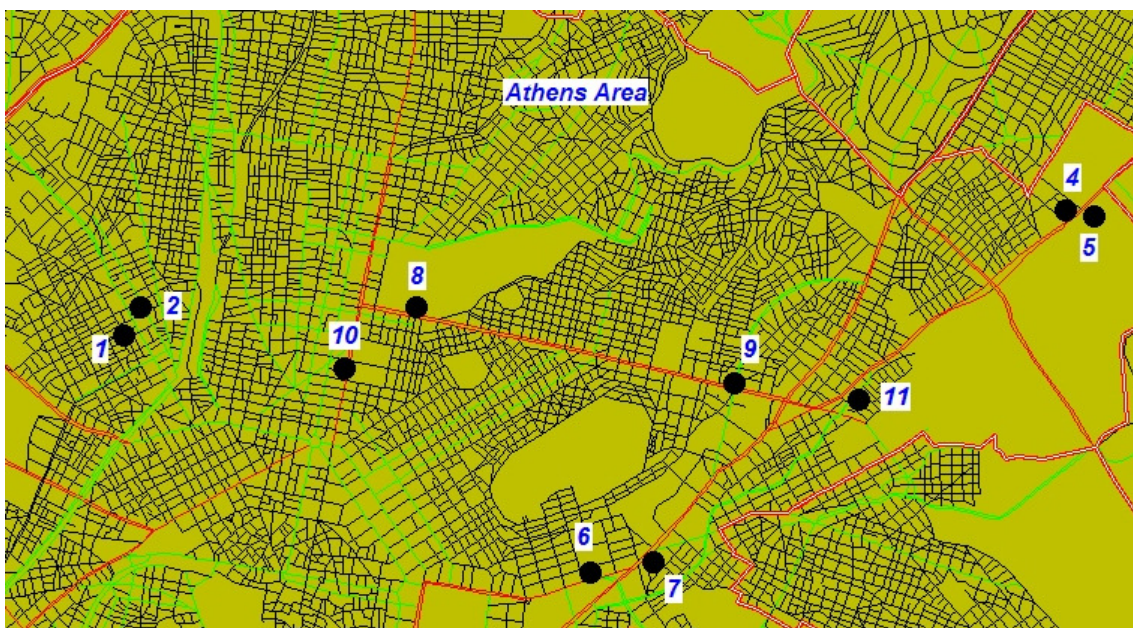
Figure 1: Surveyed downtown and near downtown bus lane locations.