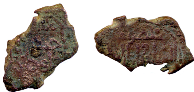
Fig. 1.5. Arabic copper coin of Davit IV (previously attributed to Davit V). New specimen