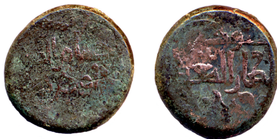
Fig. 1.7. Arabic copper coin of Davit IV (previously attributed to Davit V). New specimen