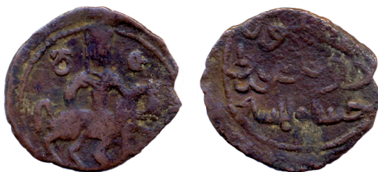
Fig. 2.14. Copper coin of Davit VI Ulu