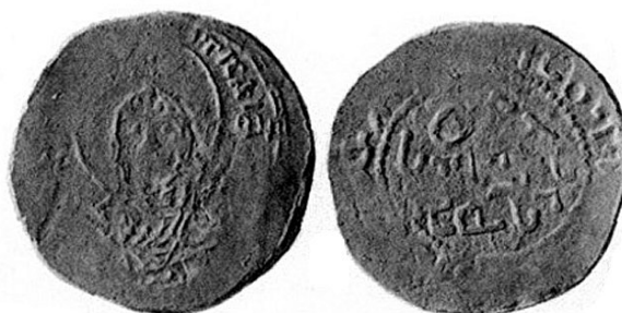
Fig. 2.2 Silver coin of Giorgi II