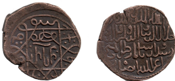
Fig. 2.12. Irregular copper coin of Queen Rusudani