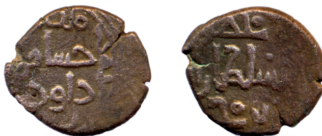
Fig. 1.1. Arabic copper coin of Davit IV (previously attributed to Davit V). New specimen