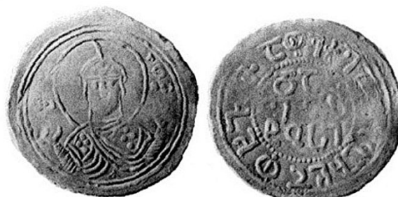
Fig. 2.1 Silver coin of Bagrat IV