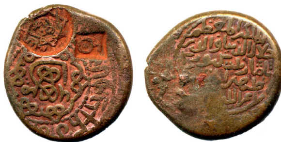
Fig. 2.8. Irregular copper coin of Queen Tamari