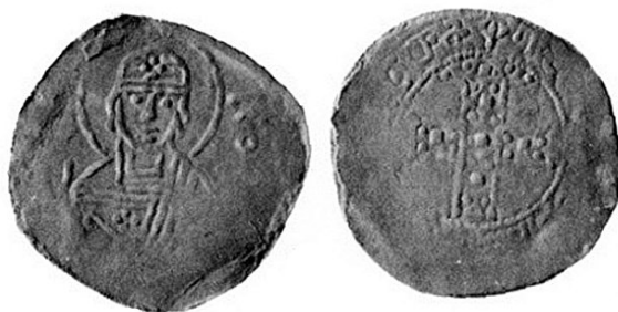
Fig. 2.3 Silver coin of Davit IV