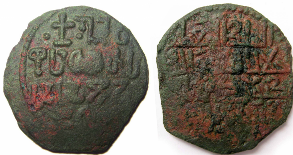
Fig. 2.10. Regular copper coin of Giorgi IV (Lasha)