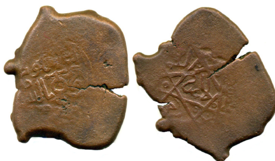
Fig. 2.6. Irregular copper coin of Dimitri