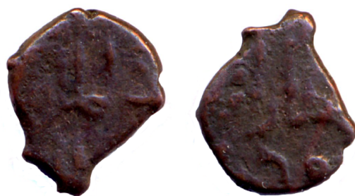
Fig. 1.6. Arabic copper coin of Davit IV (previously attributed to Davit V). New specimen