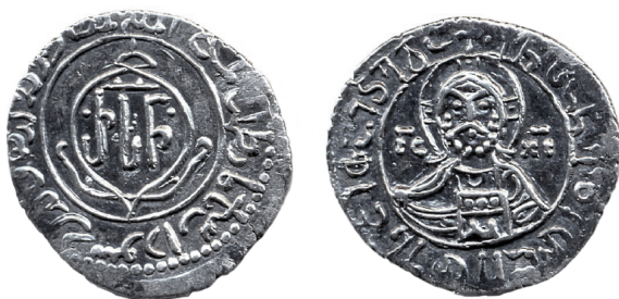
Fig. 2.13. Silver drama of Queen Rusudani