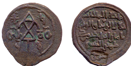
Fig. 2.9. Regular copper coin of Queen Tamari and her 2 nd husband Davit