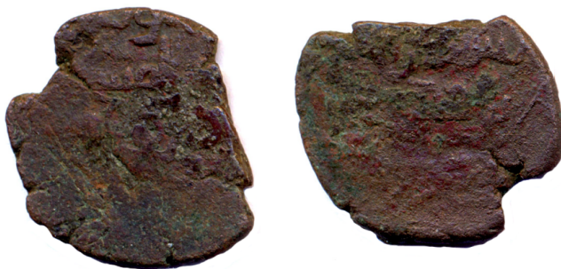
Fig. 1.4. Arabic copper coin of Davit IV (previously attributed to Davit V). New specimen