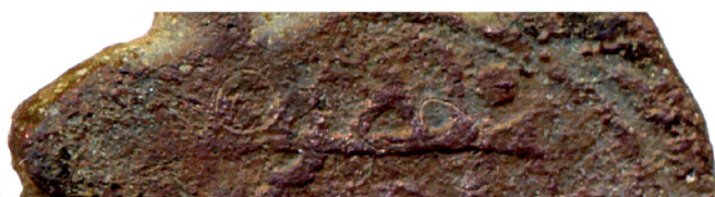
Fig. 1.5enlarged. Enlarged reverse fragment of the Arabic copper coin of Davit IV (previously attributed to Davit V). New specimen