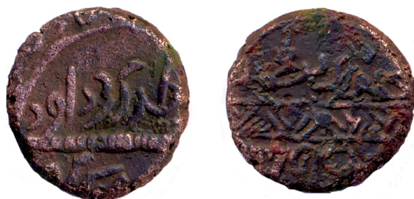
Fig. 2.5. Irregular copper coin of Dimitri, early entirely Arabic type