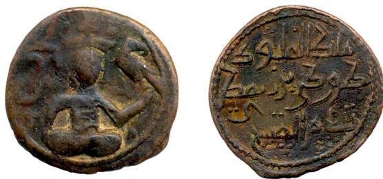
Fig. 2.7. Regular copper coin of Giorgi III