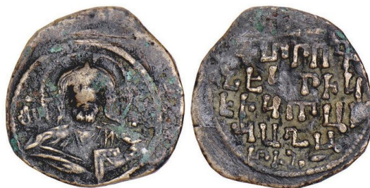
Fig. 3.2. Copper coin of Kwirike II (or I)