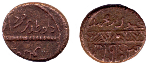
Fig. 2.4. Irregular copper coin of Dimitri I, early entirely Arabic type