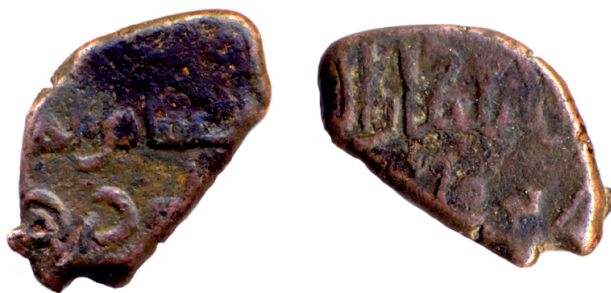
Fig. 1.2. Arabic copper coin of Davit IV (previously attributed to Davit V). New specimen