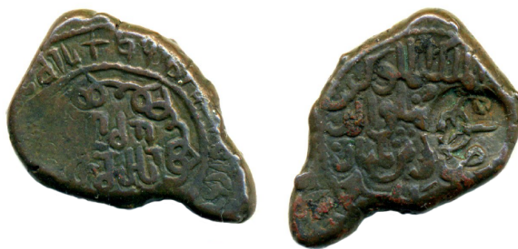
Fig. 2.11. Irregular copper coin of Giorgi IV (Lasha)