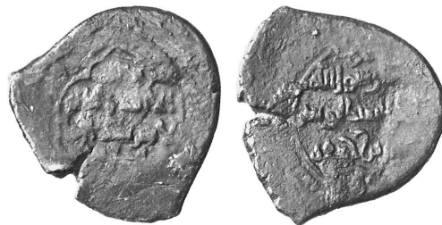
Fig. 3.1. Irregular copper coin of Manşūr b. Ja'far