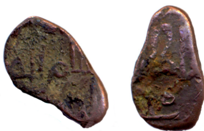
Fig. 1.3. Arabic copper coin of Davit IV (previously attributed to Davit V). New specimen