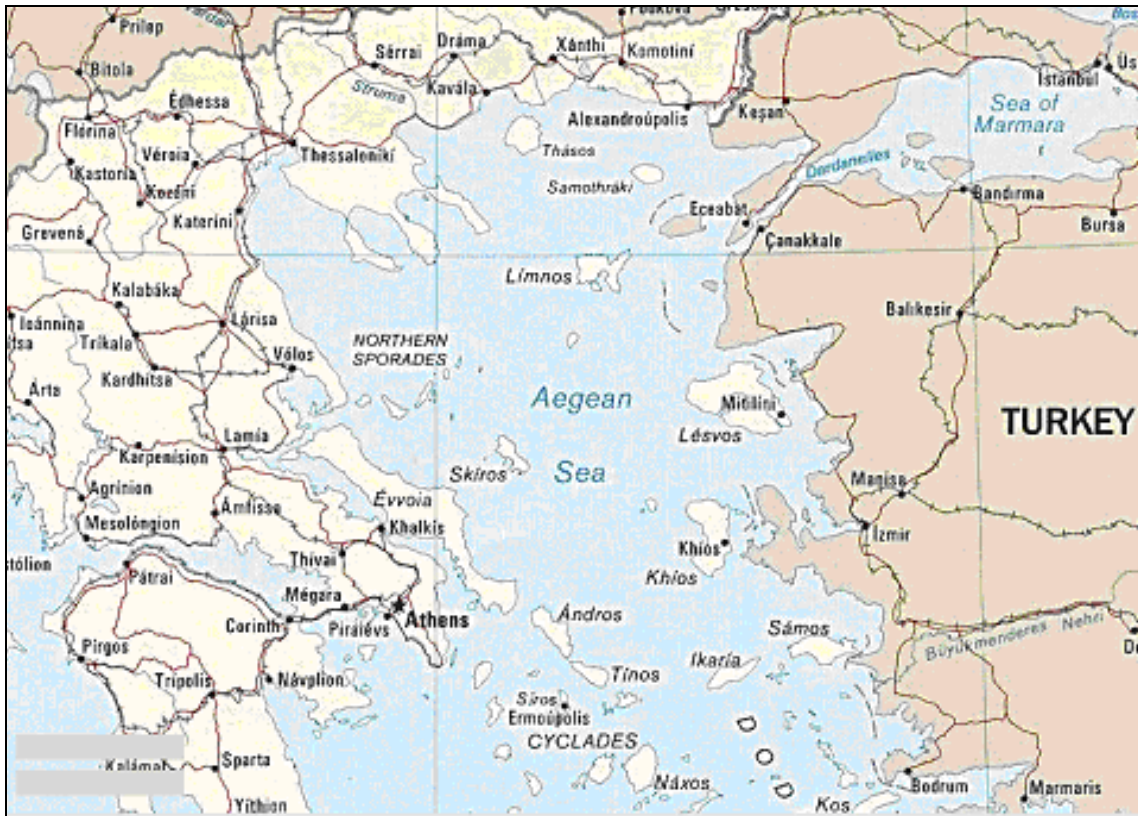
Figure 1: GIS mapping of the network.