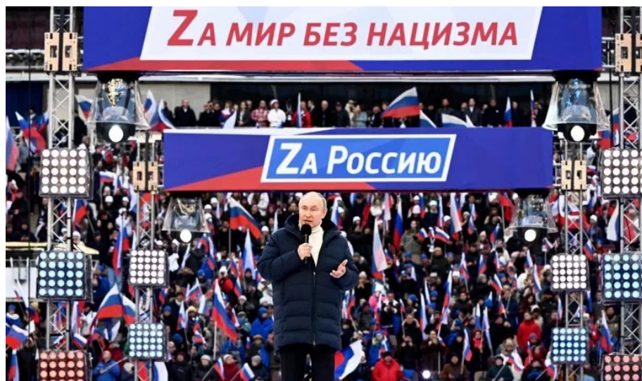
Figure 1. "For a world without Nazism, For Russia" 29 .

For the use of anti-Nazi language to be effective in this good versus evil scenario the Russian government must be seen by its audience to be the "liberator". This has gotten harder since the defeat of its gambit for a quick "liberation" of Ukraine, and the continuation of a full-scale war of ethno-national conquest 30 . Russian use of the language of anti-Nazi liberation continues 31 , now explained to entail forced "de-Ukrainization" of the territory of Ukraine and elimination of Ukrainian sovereignty 32 . Russians who oppose the war have been denounced as "traitors and