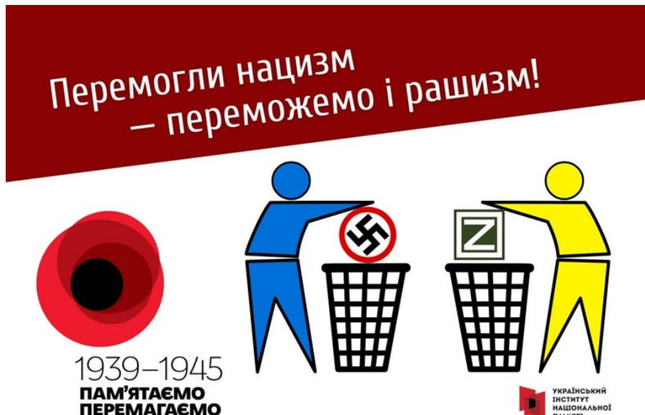
Figure 2. “We defeated Nazism - We will also defeat rashism” 37 .

vasion (Figure 2). This use seems less complicated and easier to understand, and likely to remain more consistent.