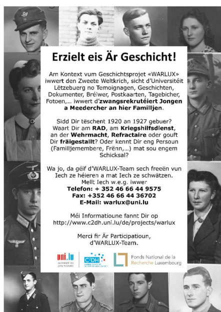
Figure 1: Flyer for the call for contributions