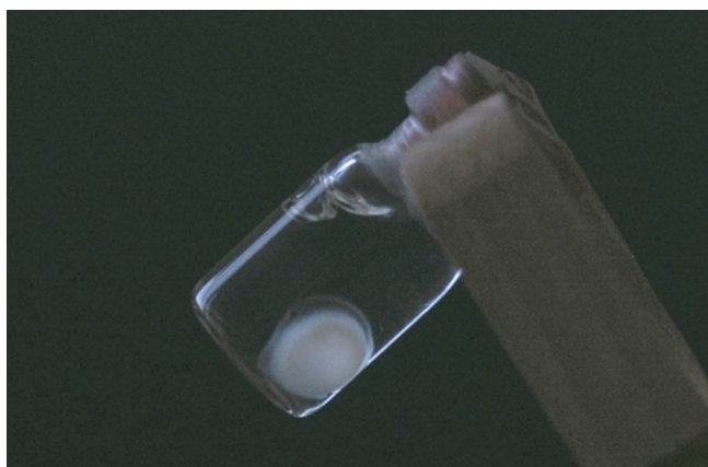
Figure 2. Stable HELP hydrogel matrix.

A method for preparation of 3D matrices with hydrogel features has been patented recently [6] and prosecution procedures are currently ongoing in Europe and USA (Figure 2).