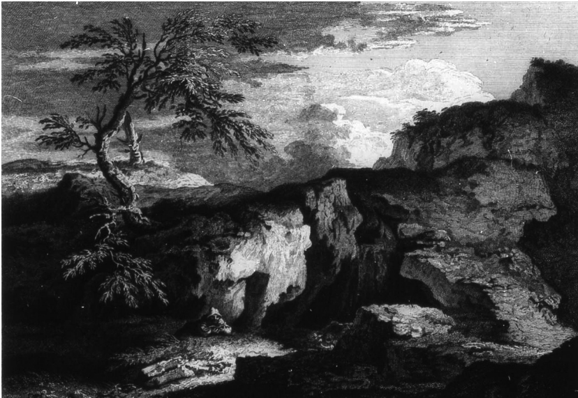
4 Engraving after Salvator Rosa, once in the collection of the landscape designer, William Kent. Private collection.