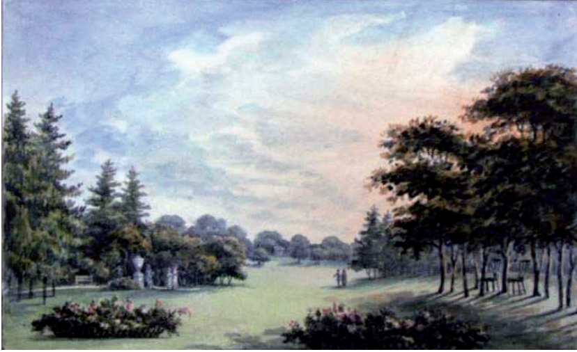
3 Humphrey Repton, from the Red Book for Tewin Water in Hertfordshire, a scene showing proposed design changes “appropriated to the daily use of its proprietors”, watercolour, 1799. Herts Archives and Local Studies, Inv. D/Z42 Z1.