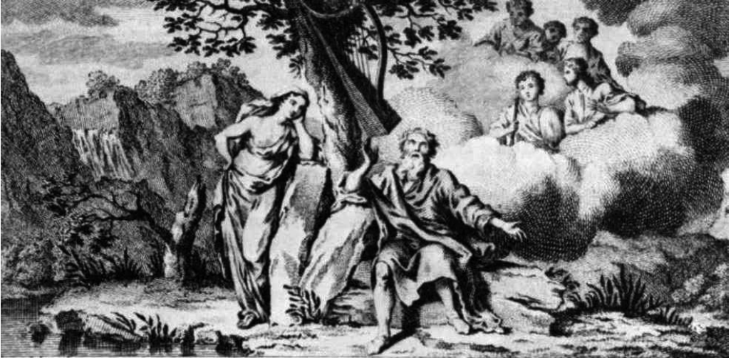
1 Samuel Wale's engraved title-page from Fingal (1761). Private collection.