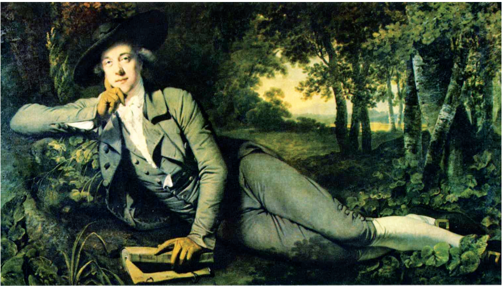
2 Joseph Wright of Derby, Brooke Boothby , oil painting, 1780-81. The Tate Gallery, London.