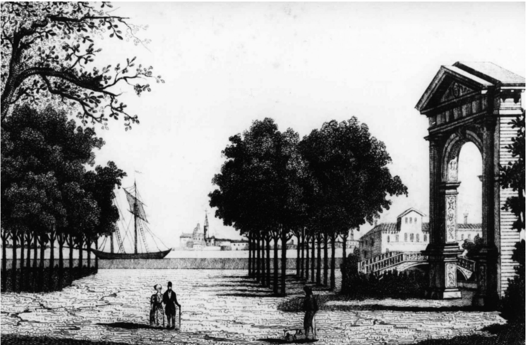
11. The arch erected in the Public gardens, Venice in 1823, from Paoletti, I Fiori di Venezia (1839-41).