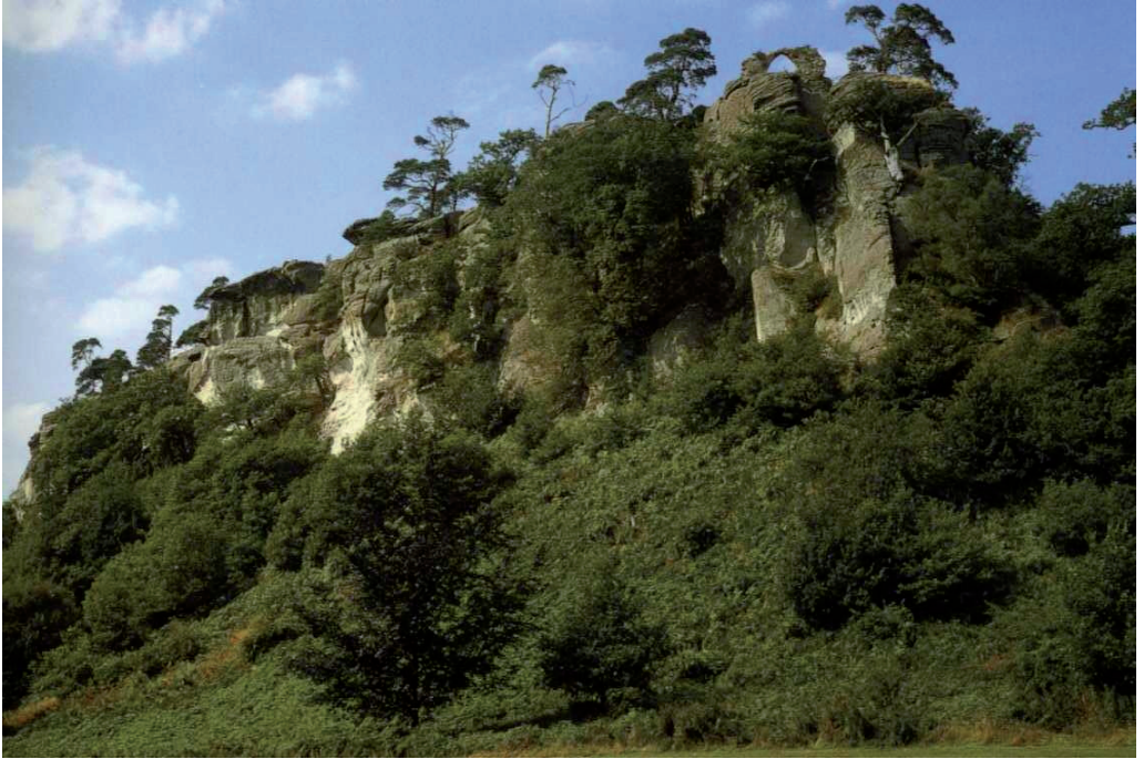
8 The cliffs in landscape park at Hawkstone, Shropshire, England.