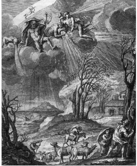
6 Engraved plates after William Kent for "Winter" in James Thomson's The Seasons (1730).