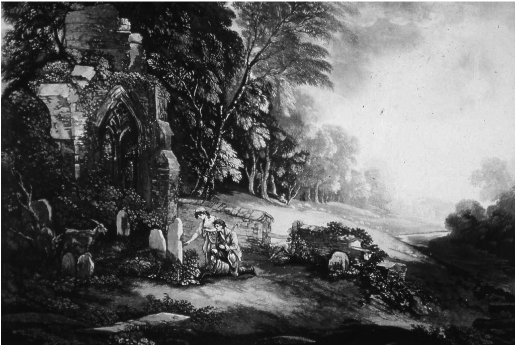
9 Maria Catherina Prestel (after Thomas Gainsborough), Country Churchyard , aquatint, 1790. Private collection.