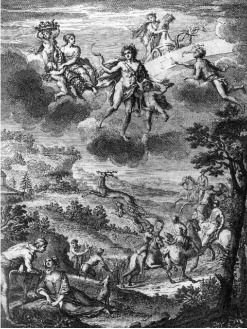
5 Engraved plate after William Kent for "Spring" in James Thomson's The Seasons (1730). Author's collection.