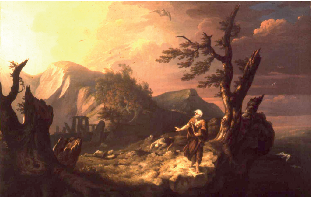
7 Thomas Jones, The Bard , oil painting, 1774. National Museum of Wales.