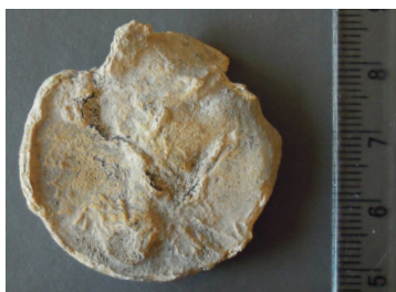
1 (O. before the restoration)