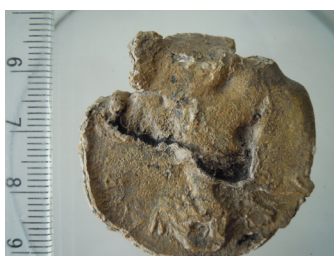
4 (O. after the restoration)