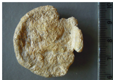
2 (R. before the restoration)