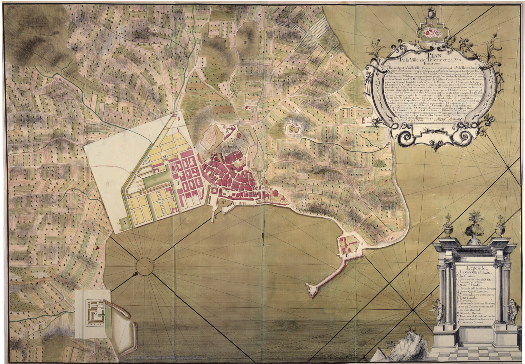
Figura 2 "Plans de la ville de Trieste et de ses environs", 1765, (source P. Di Biagi, V. Fasoli, A. Marin, Dalla città moderna alla città contemporanea. Piani e progetti per Trieste , Udine, 2002)