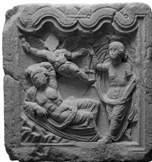
Fig. 5. Marble slab with the relief of Selene and Endymion. Celje, Regional Museum (Lupa 4119).

Marble slabs from Celeia with a relief of Selene and Endymion (fig. 5) on the frontal side and a winged childish figure holding a covered basket on