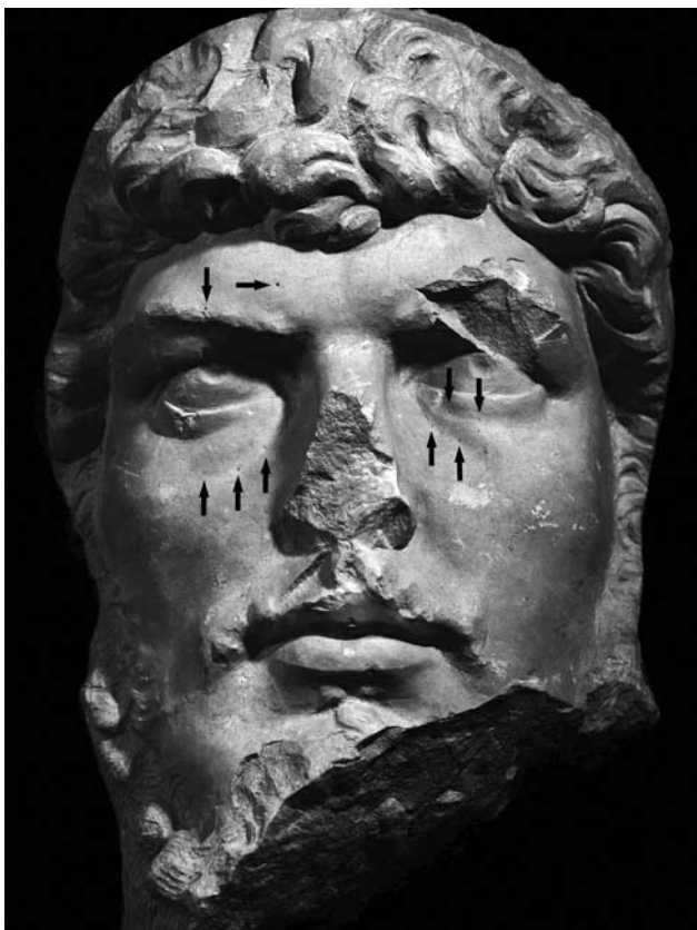
Fig. 6. Portrait of Lucius Verus. Ptuj, Regional Museum (Lupa 9384).

Not far from the Roman colony of Poetovio, below the Borl/Ankenstein Castle, a limestone copy of a colossal Acqua Traversa portrait of the Roman Emperor Lucius Verus (fig. 6) was found in 1951. Careful examination has shown that this long-supposed ancient sculpture is an unfinished face copy (mask), executed in a manner known from plaster casts in use in private academies in Roma and elsewhere across Europe. The surface of the face bears coping marks, possibly left by a pointing machine. The work is of high quality and comparable with the marble portraits produced in the second half of the 18 th century in Rome, especially in the Albacini's workshop 50 .