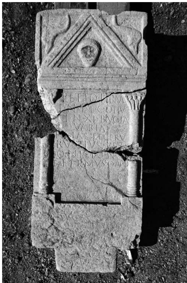
Fig. 4. Stela of Petto and his family. Ljubljana, City Museum (Lupa 24391).

The funerary stelae from the Ig area can be classified as architectural stelae of the aedicula type with a triangular gable (A/I-IV) or a portrait niche (B/I-IV). Workshops may have existed at Strahomer, at Ig, and in Iška vas, all working at the same time, between the 2 nd and 3 rd centuries AD. The group of stelae from Strahomer is also homogenous in its decoration, for only within this group do we encounter a dolphin with a triangular tail 22 .