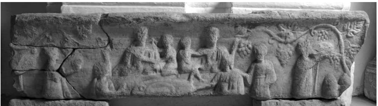
Fig. 7. Convivium sarcophagus. Ptuj, Regional Museum (Lupa 5297).

The corpus of ossuaria (a small relief-decorated stone coffers with roof-like covers, meant for the storage of the cremated remains of several deceased individuals) that comes from cemeteries of Poetovio and its territory includes 64 examples in Pohorje marble, specifically 42 receptacles and 22 lids. The recognizable characteristics of this group of funerary monuments are as follows: a larger or smaller rectangular receptacle with a tripartite division on the frontal side, on which both narrower side panels are mostly raised. A lid with eaves and bold acroteria on the four corners covers the receptacle. The ridge is placed perpendicularly on its longitudinal axis, so