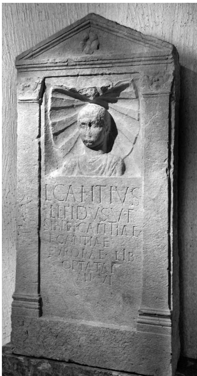
Fig. 2. Stela of Lucius Cantius Fidus. Ljubljana, City Museum (Lupa 20798).

ern Emona necropolis. The freedman Lucius Cantius Fidus (fig. 2) set it up in the middle of the 1 st century AD for himself and his six-year-old daughter Cantia Optata. The tombstone shows stylistic similarities